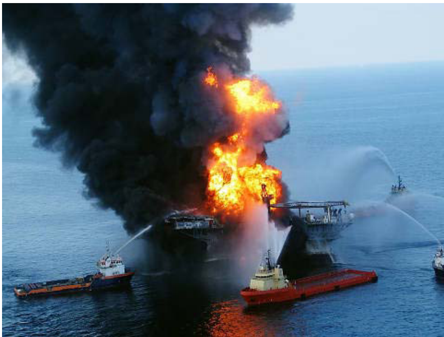
U.S. Coast Guard

Fire boat crews battle remnants of fire on oil rig off the Louisiana coast.